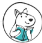
Chart of Accounts

Each transaction in your business, from a product sale to the purchase of new materials and beyond, will either add to or subtract from the accounts in your chart of accounts.